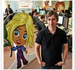
Zynga's Tough Culture Risks a Talent Drain

Home | World | U.S. | N.Y. / Region | Business | Technology | Science | Health | Sports | Opinion | Arts | Style | Travel | Jobs | Real Estate | Autos | Site Map © 2011 The New York Times Company | Privacy | Your Ad Choices | Terms of Service | Terms of Sale | Corrections | RSS | Help | Contact Us | Work for Us | Advertise