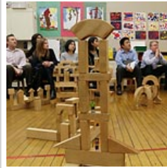
With Blocks, Educators Go Back to Basics