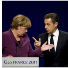
G20 FRANCE 2011