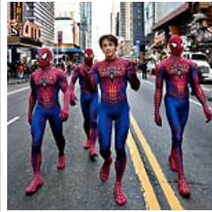
After a Year, 'Spider-Man' Earns Its Weekly Keep