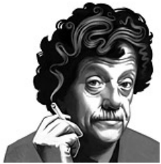
How It Went